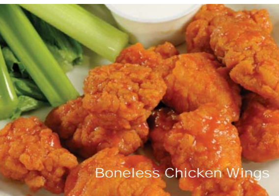
Boneless Chicken Wings