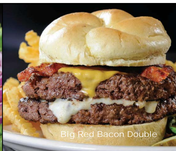
Big Red Bacon Double