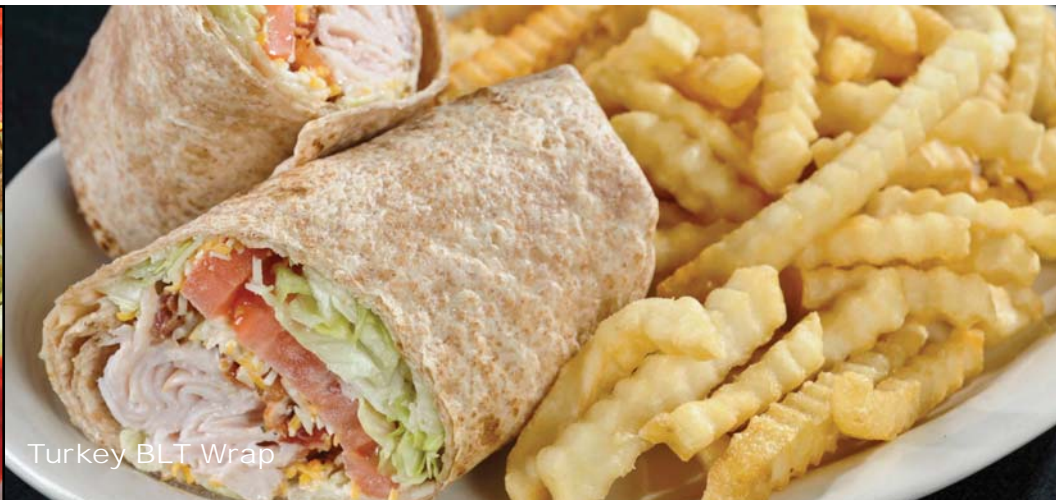
Turkey BLT Wrap