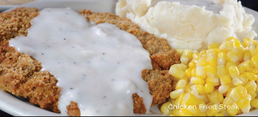
Chicken Fried Steak