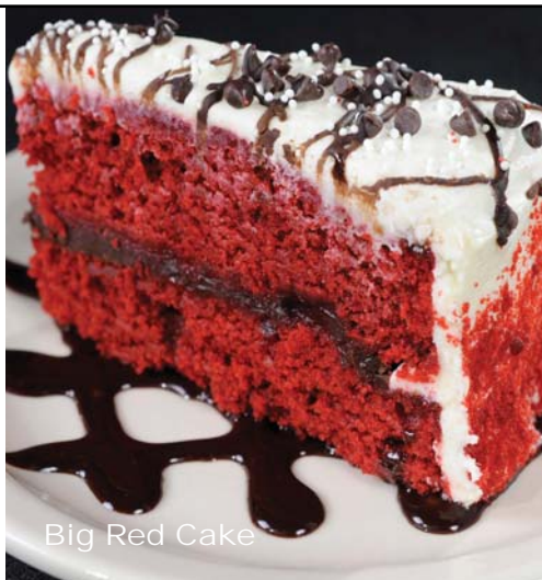
Big Red Cake